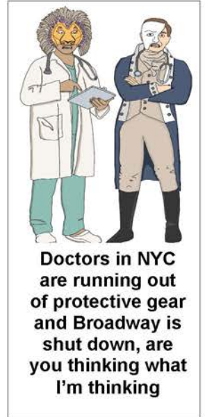
Doctors in NYC are running out of protective gear and Broadway is shut down, are you thinking what I'm thinking