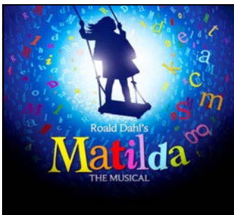
November 1, 2 & 3, 2019